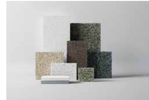
Steni Nature Surface of crushed natural stone or recycled glass. Robust, tactile and natural appearance.