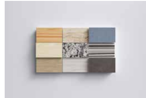
Steni Vision Printed surface with virtually unlimited visual possibilities: graphics, photography, patterns or illustrations.