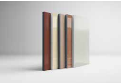
Steni Colour Smooth and robust surface. Standard and custom colors (NCS/RAL) – three gloss levels.

Steni is developed with a focus on efficient design processes – and reliable execution. A standardized core – prefabricated solutions – and flexible formats provide high predictability during construction.