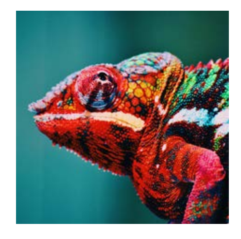
INTEGRATION ADAPTIVE FUNCTION

Adapt and add value to your surroundings, by blending in or by adding a new perspective.