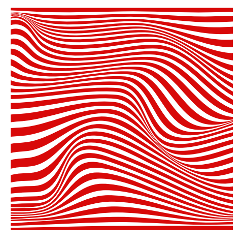
ILLUSION DECEIVING AESTHETICS

Stand out by giving the building a unique personality and attitude.