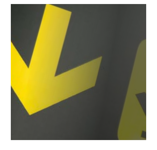
INFORMATION CLEAR MESSAGE

Adapt and add value to your surroundings, by blending in or by adding a new perspective.